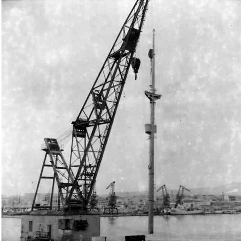
The new mast is installed with a floating crane