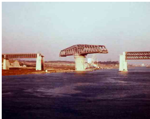
The bridge is swinging to the closed position. The vessel is towed astern from the oil plant in the back through the bridge opening. From this photo it should be clear, why the mast fell over the starboard side of the forecastle.