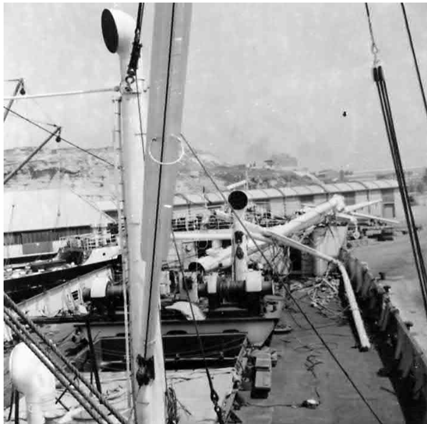
The full extent of the damage