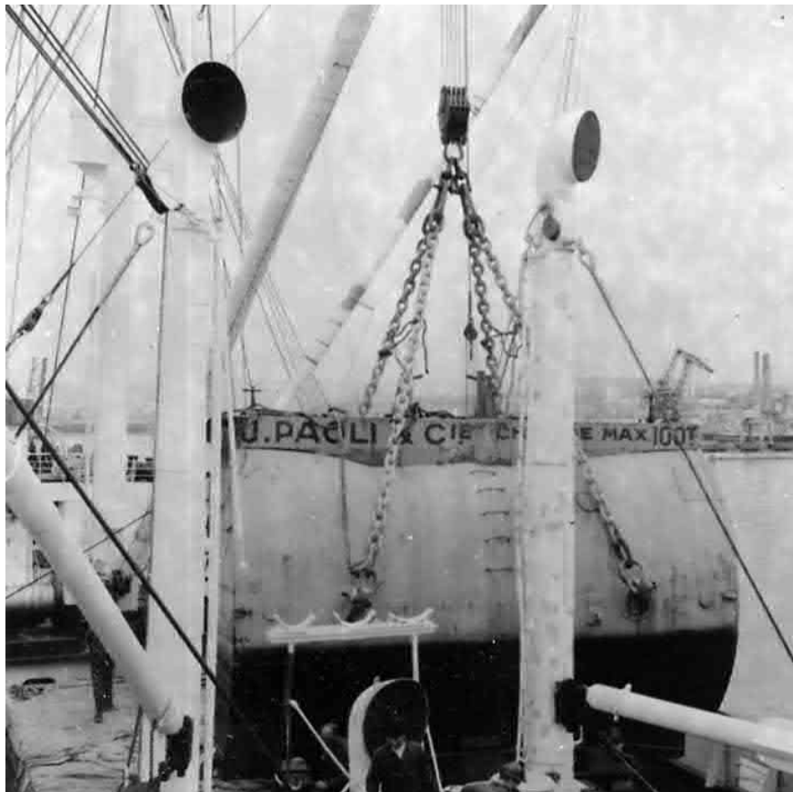
The mast and the heavy lift derrick are tested, using a graduated water tank. The tank is filled with water to the required level, giving the exact test weight.