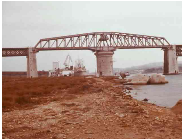
The closed railway bridge. In the back the oil plant with the HELVETIA (1965)

The SAENTIS steamed up this canal and moored with her portside on the pier of the plant. After the discharge was completed, the freighter was moved with the aid of two tugs astern through the bridge opening for turning further down in the canal. As usual, the pilot arranged with the railway company the opening of the bridge and the passage of the vessel. When the vessel was towed through the bridge opening, the bridge keeper commenced to close the bridge far too early, although no train was expected. The bridge touched and broke the forward mast of the SAENTIS, which fell over the starboard side of the forecastle. Later it was rumoured that the bridge keeper had drunk a few glasses too much.