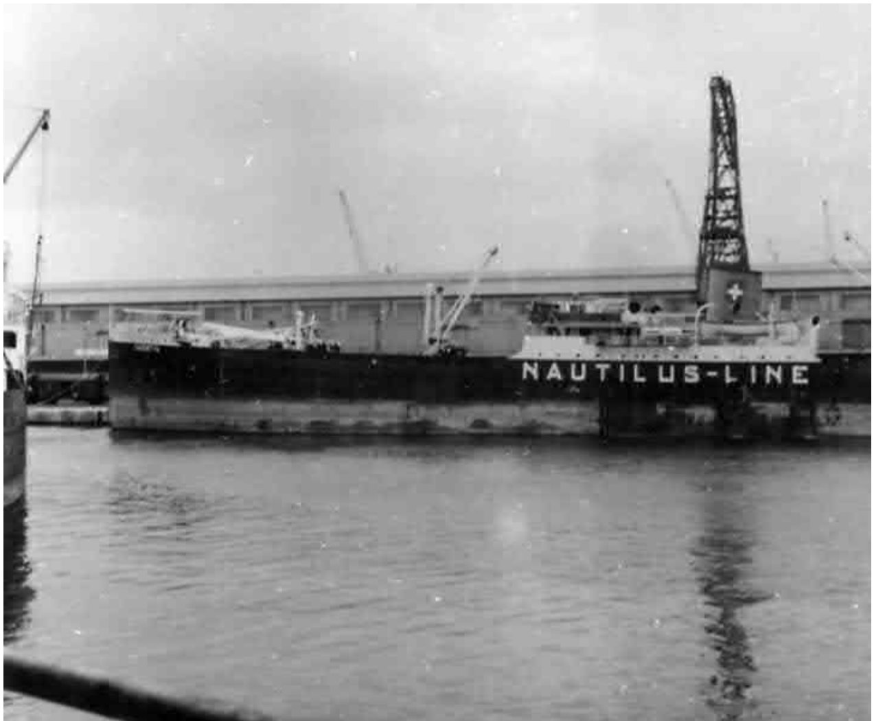
Without forward mast. The SAENTIS after the incident in the port of Marseille