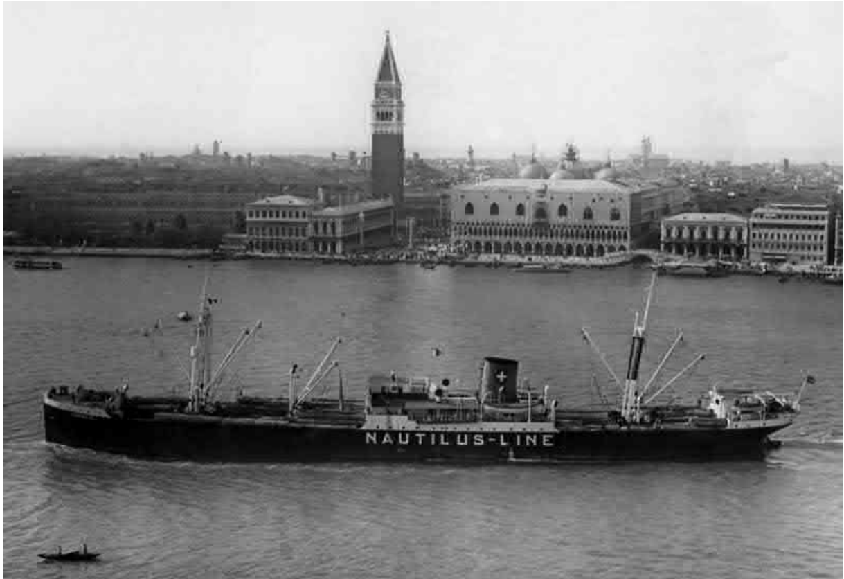
The SAENTIS arrives 1959 in Venice with a cargo of logs from West Africa